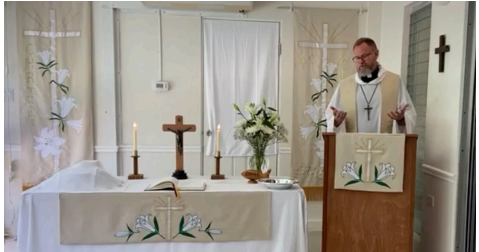
The new Easter paraments and the new Palm Sunday set on the left.