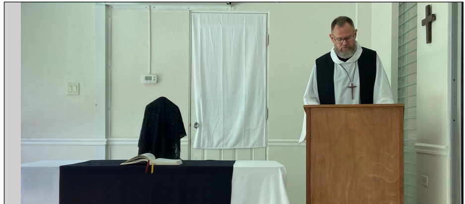
Safe Harbour celebrated the solemn Holy Week services of Maundy Thursday and Good Friday, culminating in the joyous Easter resurrection service.